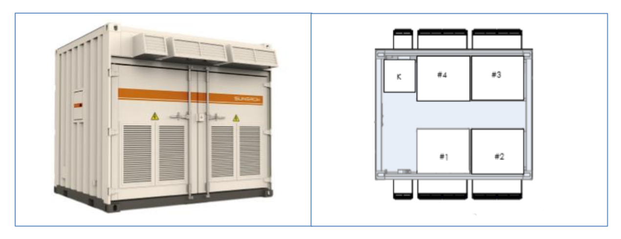
Figure 1: SG2500 turnkey station and internal device layout

This document will guide installers how to restart the smart unit board at the communication power distribution cabinet/Intelligent PMD in SG2500/SG2500MV turnkey station. Installers need to prepare a laptop and Internet cables to connect to the smart unit board.