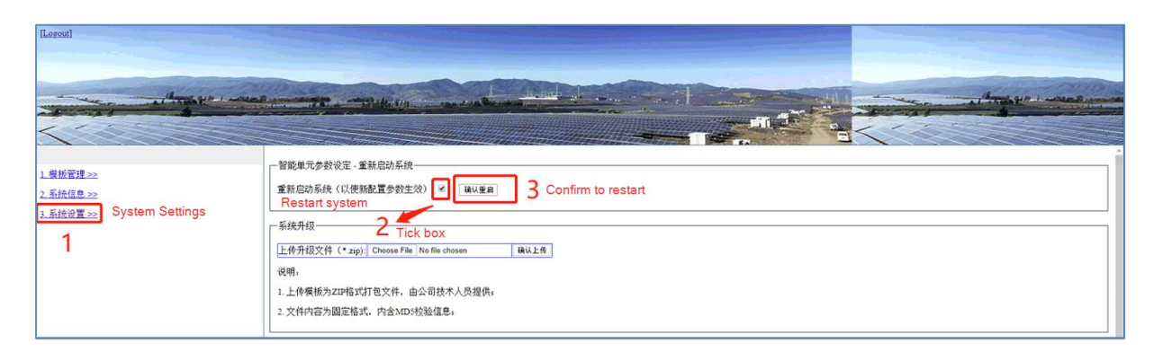
Figure 4: Web interface to restart the smart unit board

4) Check at the inverter HMI and observe the success rate of communication between the inverter and PC.